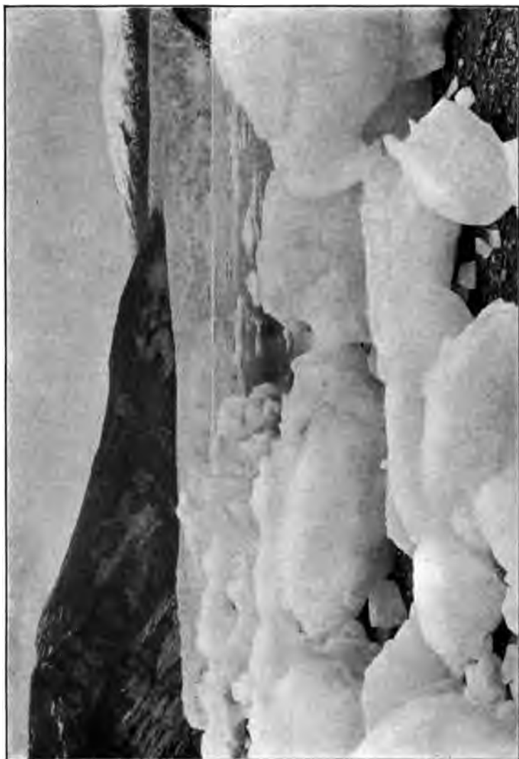
STRANDED ICEBERGS, TAKU GLACIER